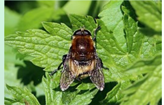
Narcissus_bulb_fly_ (Merodon_equestris)_grooming

By 2008, joint problems dictated a smaller property and a move into town. We found a 1930 house with an old garden saturated in places with bulbs. There were tommy crocuses, Muscari and snowdrops thick on the ground plus clumps of Narcissi ranging from the traditional yellow "King Alfred" (no one knows what the original 'King Alfred' was), to the white-with-orange-cup Pheasant's Eye or poet's narcissus (classic Latin poets, not Wordsworth) and their hybrids x Incomparabilis . Completing the show were some hyacinths and tulips. Of these, tulips, Muscari, hyacinths and crocus are not Amaryllids, hence not touched by the fly, but in 2010, the first deer in over 100 years arrived on our street and the indulgent Oak Bay council has allowed a dense population to form. The fly took out most of the Amaryllids, the deer the rest. Snowdrops, with their smaller bulbs, seem less susceptible to the fly.