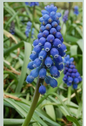
Muscari Neglectum